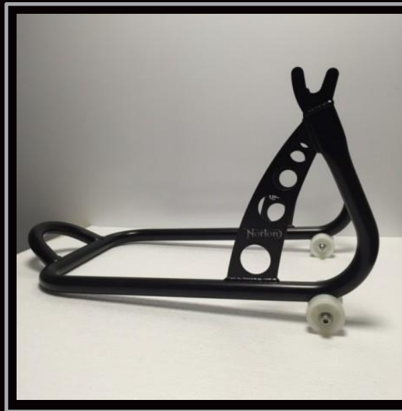
• Norton Paddock stand