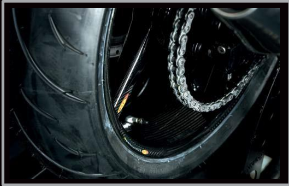
• Carbon Wheels