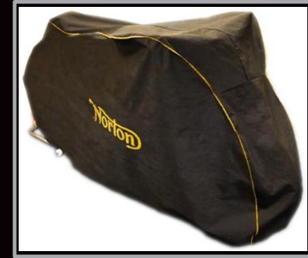
• Norton Bike cover