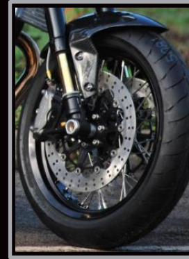
• Black Wheels