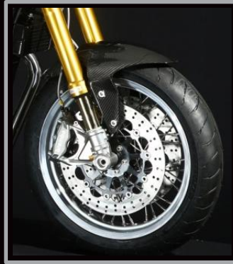
• Polished Wheels