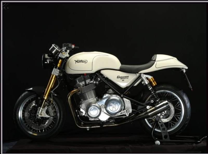
• Short or Long aftermarket exhaust