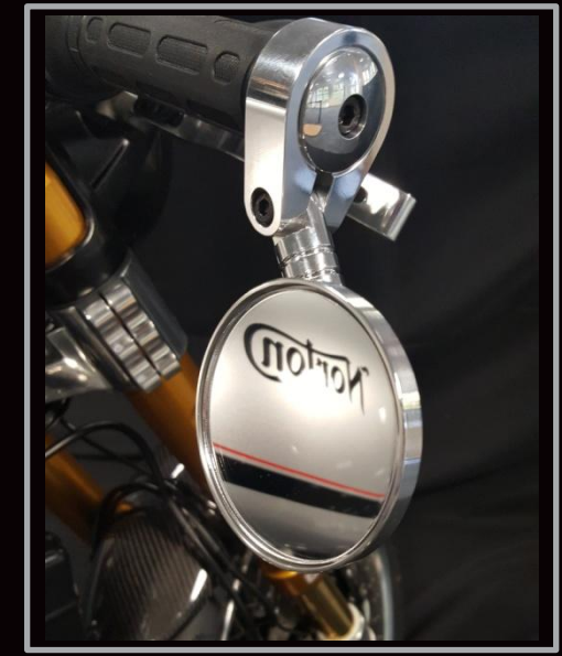
• Norton Bar End Mirrors